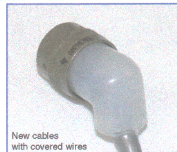
New cables with covered wires

Also, the cable connections must be cleaned periodically, older cables should be sealed with RTV. The new cables do not require sealant.