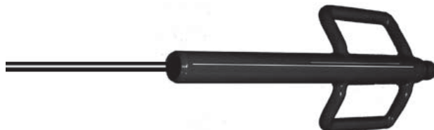
Utility Anglefin Handle