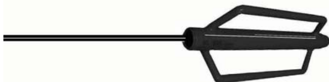
Heavy-Duty Anglefin Handle